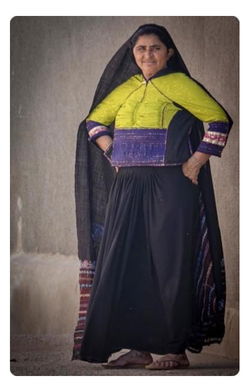
Day 11 – Bera Wednesday, February 2, 2022 Meals: Breakfast, Lunch, Dinner

HIGHLIGHT! This region has become famous for its leopards which are attracted by the scrub, cactus and caves that dominate the landscape. It helps that the locals have learned to co-exist with them, helping make our chances of spotting them even better.