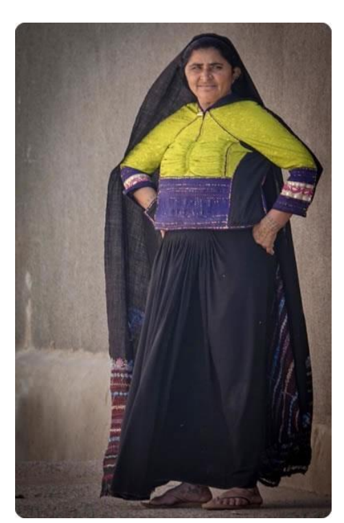
Day 11 – Bera Wednesday, March 17, 2021 Meals: Breakfast, Lunch, Dinner

HIGHLIGHT! This region has become famous for its leopards which are attracted by the scrub, cactus and caves that dominate the landscape. It helps that the locals have learned to co-exist with them, helping make our chances of spotting them even better.